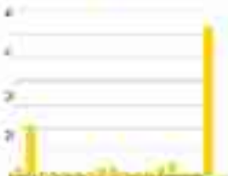
Bar chart showing the number of hate based care incidents reported in 2020 and 2021.

The chart shows a significant increase in hate based care incidents from 2020 to 2021. In 2020, there was 1 incident reported, while in 2021, there were 5 incidents reported.