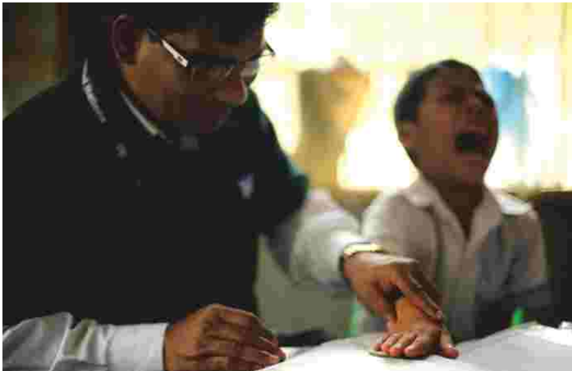
Professional UNVs through UNDP providing appropriate service to TMI student