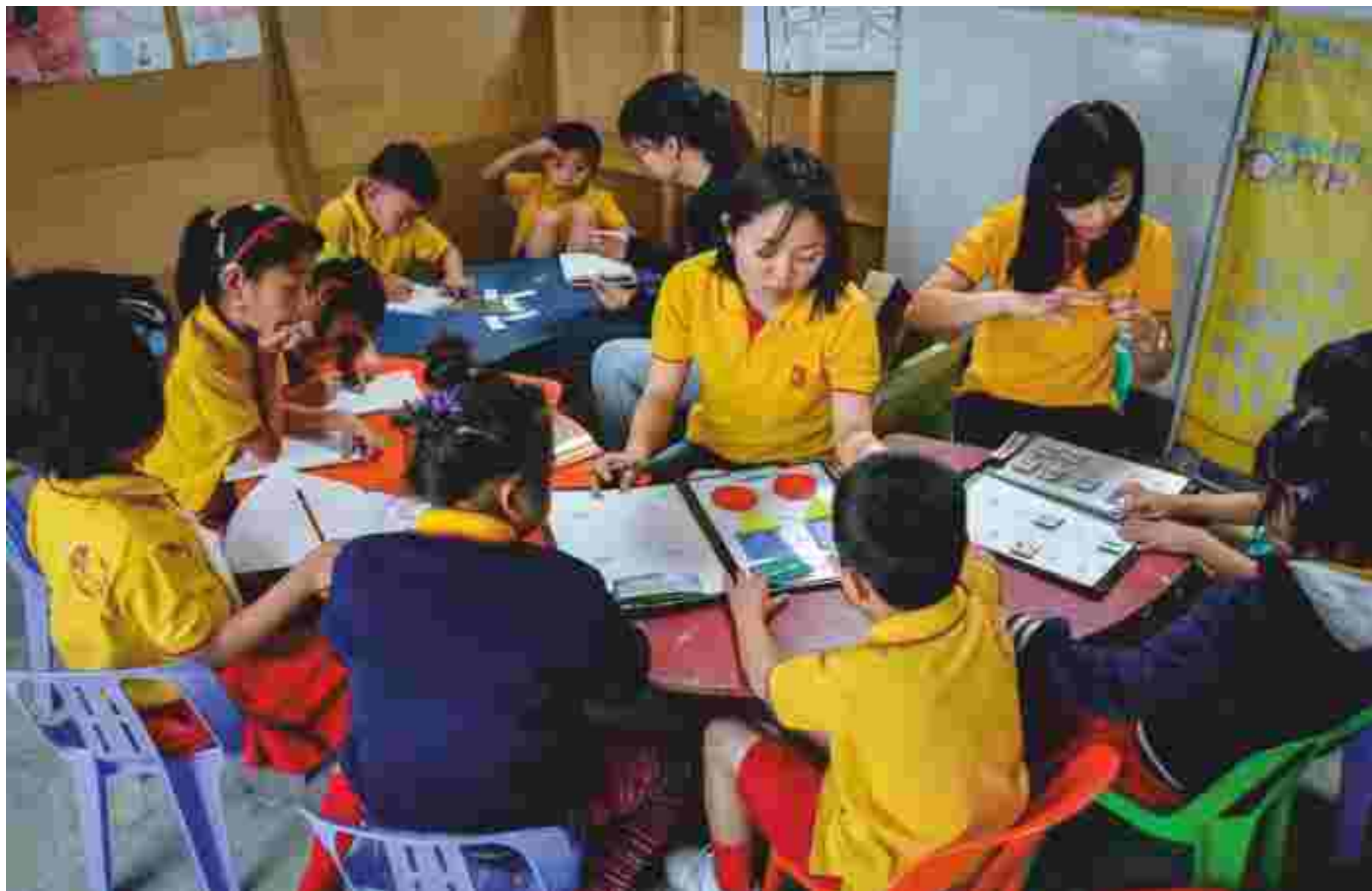
Teachers supported by National Foundation for India (NFI) taught children with adaptive curriculum