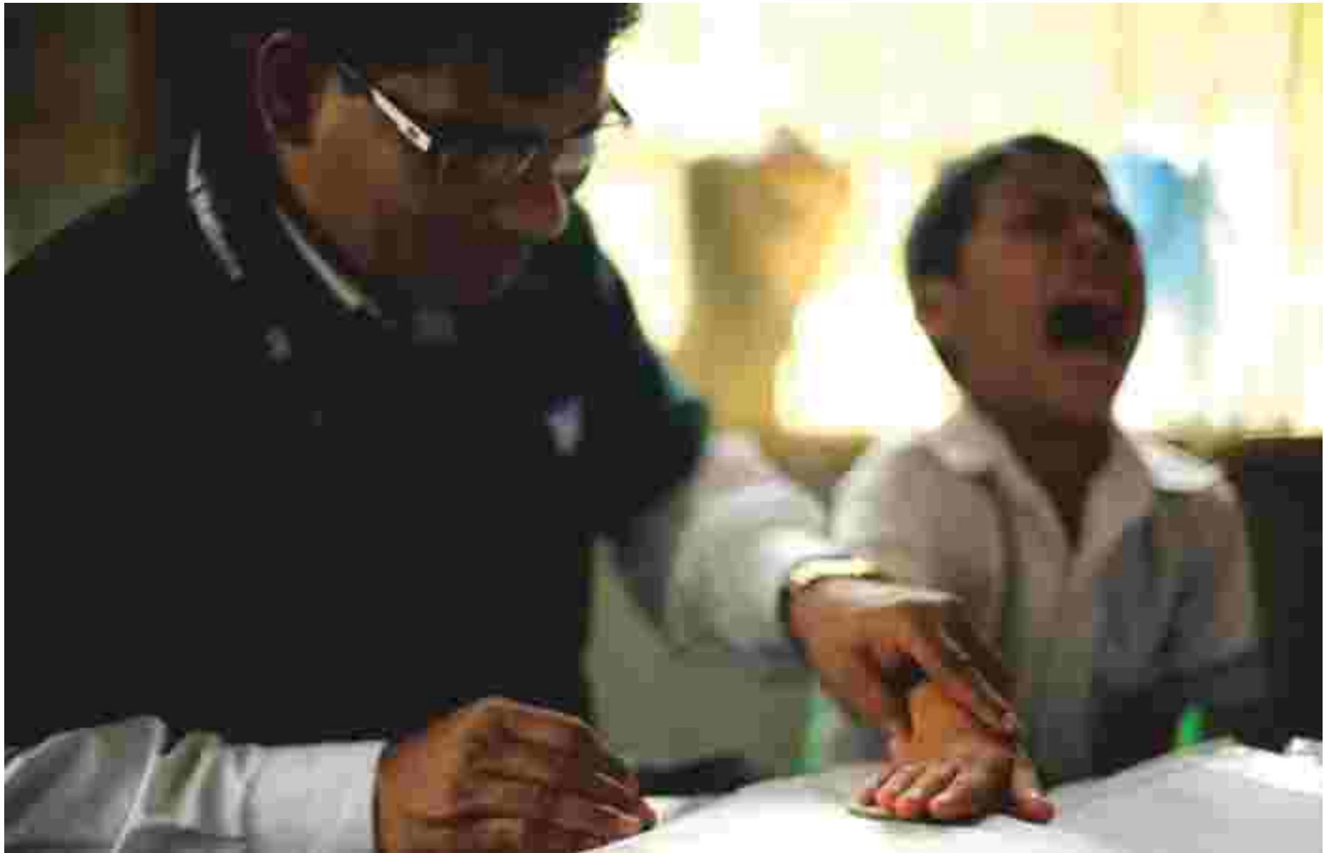
Professional UNVs through UNDP providing appropriate service to TMI student