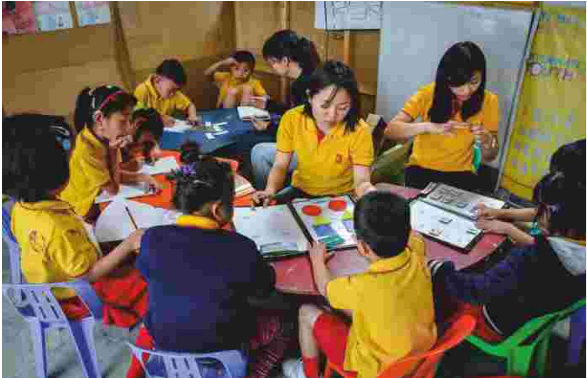
Teachers supported by National Foundation for India (NFI) taught children with adaptive curriculum