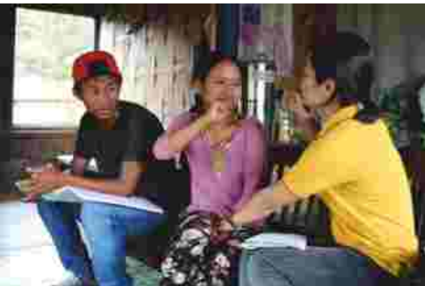
Village Based Rehabilitation with support from CBM